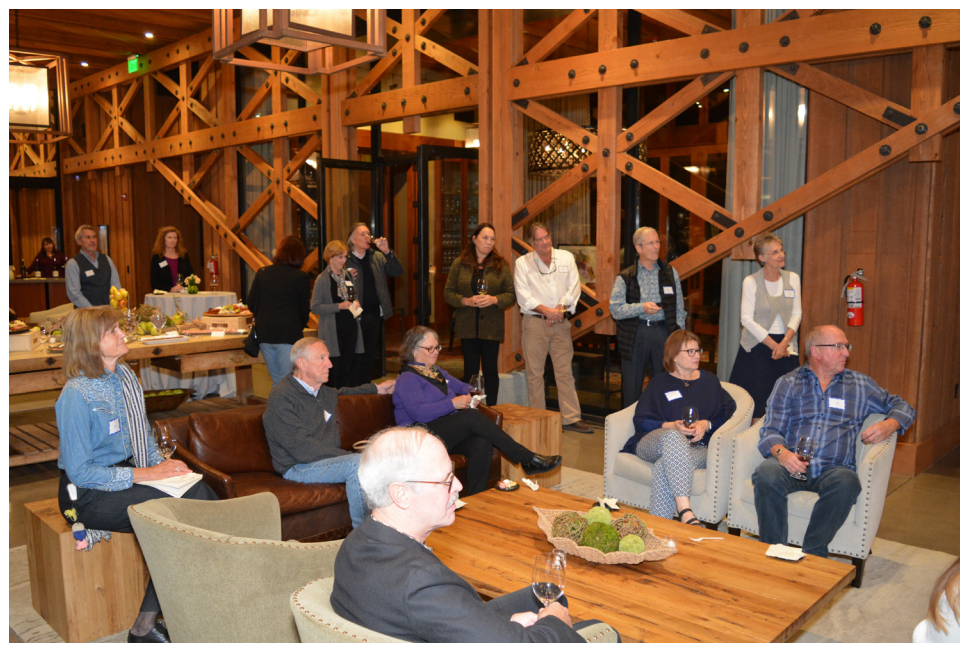
Great Hall, Joseph Phelps Vineyards