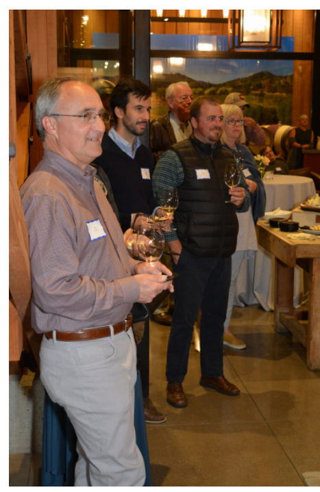
Top Left: Entrance to the Winery and Tasting Room Top Right: Very Local Color Bottom Right: Attentive Guests